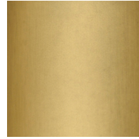
Brass - BRA